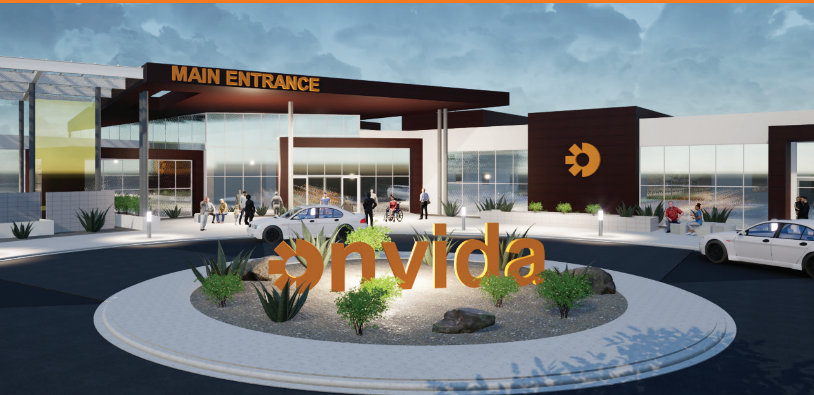
Above: Rendering of the new Yuma VA Outpatient Clinic Below: Rendering of the new San Luis Medical Campus